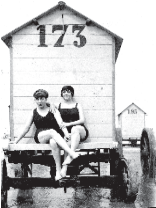
At ocean resorts where the water was shallow, modest women undressed in little houses on wheels which were then drawn out into deep water by horses and hauled back to shore when the bathing was finished.

Summer is on its way and about to make a big splash at the Westport Historical Society with the opening